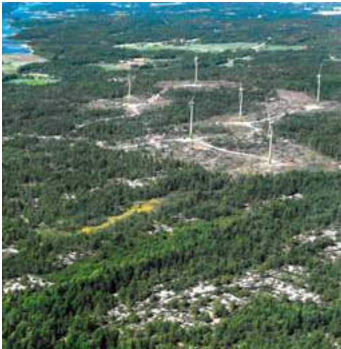
Wind power in rocky terrain in western Sweden.