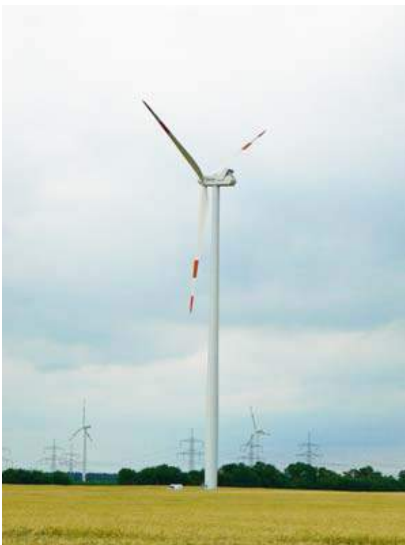
Wind farm near Cottbus, Germany.

In a Finnish study of domestic reindeer on a regional scale, the reindeer's choice of home range and grazing area within the home range was studied (Anttonen et al. 2010). In this study, reindeer avoided areas with major roads, but not areas with minor forest roads, presumably due to the low activity on the latter road type. The Norwegian VindRein project showed that domestic reindeer who returned to a wind farm area after the construction phase was completed still avoided the access roads into the area (Colman et al. 2008).