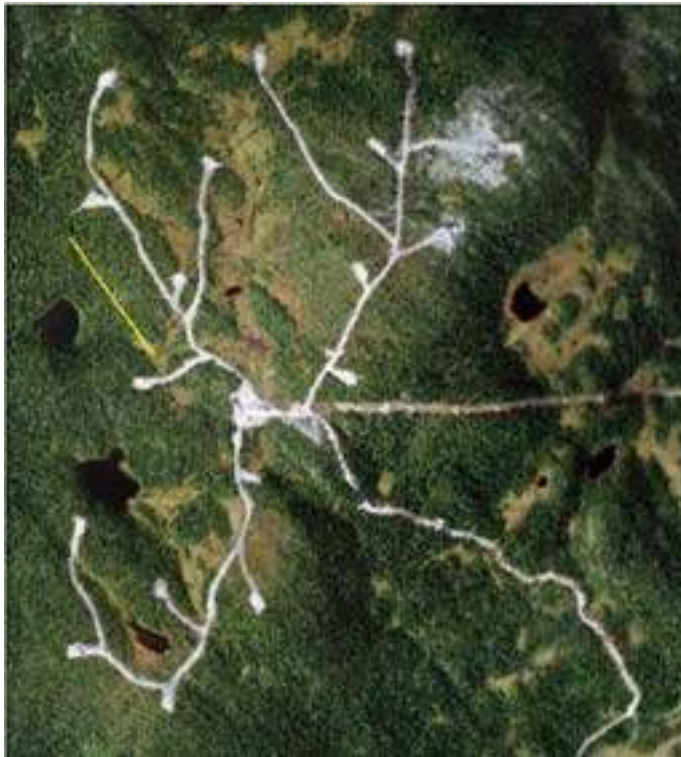
The wind farm at Bliekevare, Västerbotten county, Sweden, where ca 9 km new road has been constructed, and the average width of the road area is 21 m (Rönnqvist 2011). A 500 m line (yellow) is inserted in the picture for scaling. At the time of the image the wind farm is under construction.