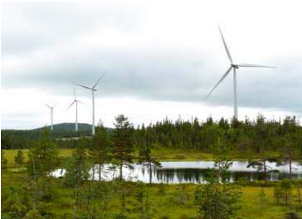
Wind power at Kyrkberget in Mid-Sweden.

As it is well known that mammals can be affected by various types of human disturbance and exploitation, it is reasonable that also wind power has effects. With the increasing expansion of onshore wind power, the question of effects on terrestrial mammals is increasingly brought up by hunters, conservationists, and not least reindeer husbandry. Wind power planning will increasingly include management issues relating to large carnivores, moose and other larger wildlife, and in all wind power development within the reindeer husbandry area, the impacts on reindeer and reindeer herding are important issues. A knowledge basis is needed to support the necessary trade-offs between interests.