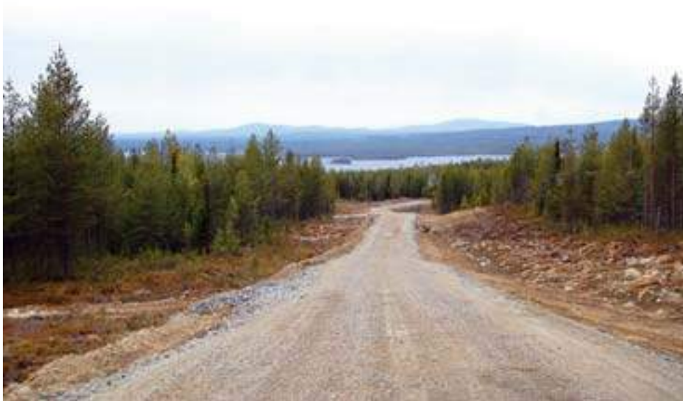
New road in Storliden wind park in northern Sweden.

To further provide food and shelter for herbivores, one could choose to manage available land along roads and power lines in wind farms to promote the growth of shrubs and herbs and create diverse forest edge habitats. Such management could have a significant contribution to ungulate forage, and may decrease the grazing pressure in the surrounding woodland (assuming that ungulate populations are regulated through hunting). In this context, however, there is reason for caution that areas rich in small mammals, carrion of large herbivores, etc. can attract birds of prey, which in turn run the risk of being killed by wind turbines.