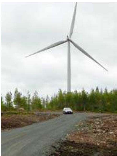
In most wind farms, roads are open for all traffic. The wind farm at Kyrkberget, Sweden.