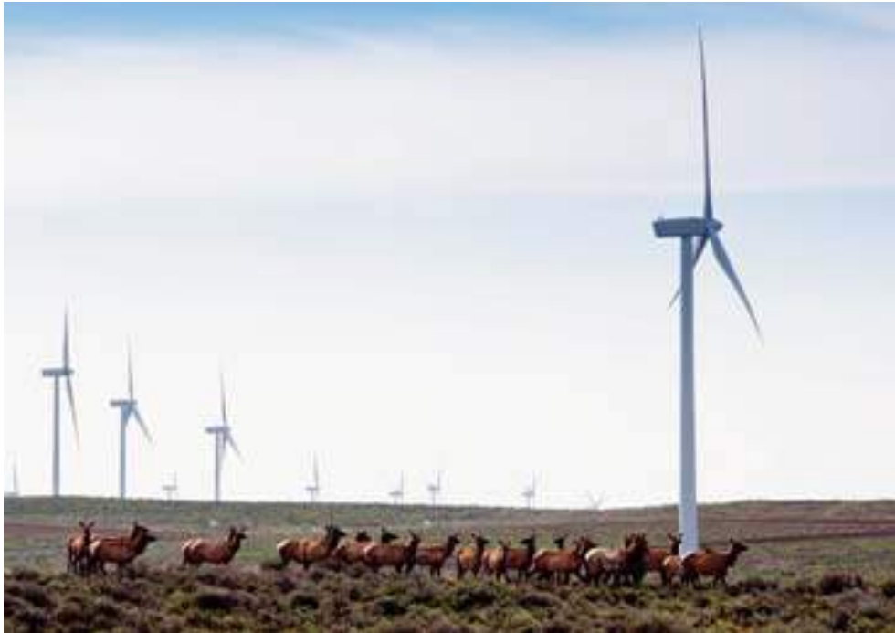
North American elk at a wind farm in Washington State, USA.

The Norwegian project VindRein, that has been running since 2005, identifies how reindeer are affected by wind farms in open terrain such as mountain areas and along the Norwegian coast. Preliminary results from the project show that the reindeer avoided wind farms during construction but that they subsequently came back to graze within the wind farms (Colman et al. 2008). It should be emphasised though, that during the expansion of large wind farms, the construction phase extends over several years, and some effects during this phase can thus be long-lasting (at least along the main access roads).