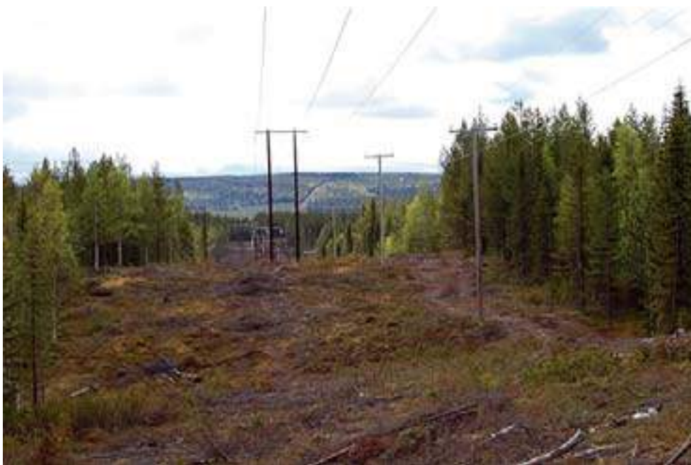
New power line at Jokkmokkliden wind farm in northern Sweden. Another new power line, for Storliden wind farm, is visible in the background.

Other studies indicate no such avoidance. Reimers et al. (2007) could not find that wild reindeer avoided the area around a power line. In this study, however, only reindeer within 3 km from the power line was studied, while other studies have noted that reindeer avoid a zone up to 4 km away from major power lines, and instead choose to reside in areas 4–10 km away from power lines (Nellemann et al. 2001, Vistnes & Nellemann 2001, Vistnes et al. 2004). A more recent study on reindeer habitat choice within 5 km of a transmission line showed that they did not avoid the area around the power line (Bergmo 2011). Local studies of reindeer behaviour in the vicinity of power lines